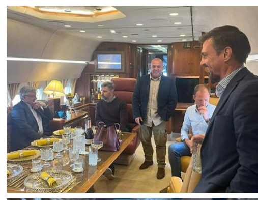
Pytch Lunch on a Plane 16<sup>th</sup> April 2024